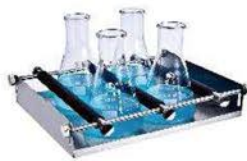
Adjustable Universal Platform UP-12