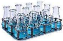
Conical Flask Stand P12-100