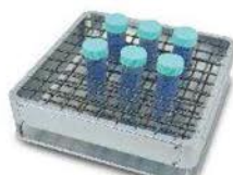
PW-260 Universal Platform