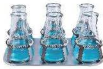
Conical Flask Stand P6-250