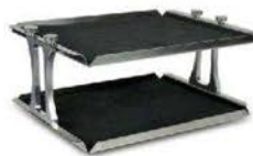
Double-level Platform PP-4A