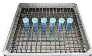
Platform PW-420 (Only for ES-60+)