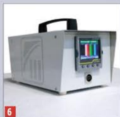
6 Portable paperless recorder with graphical screen