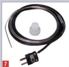
7 Thermocouple J probe