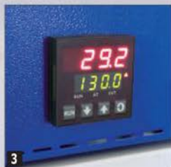
3 Temperature profiler