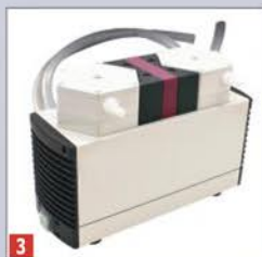
3 Vacuum kit for chemical products