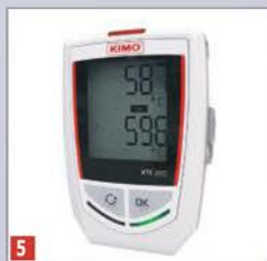
5 Data logger with 2 channels