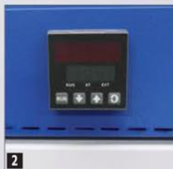
2 Vacuum profiler