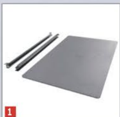
1 Tray with guide bars