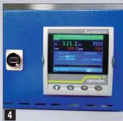
4 Temperature + vacuum profiler and recorder