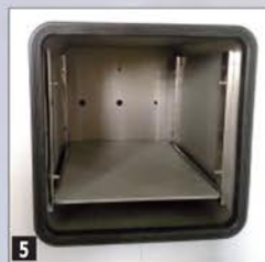
5 Door gasket made of Viton