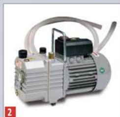
2 Vacuum kit