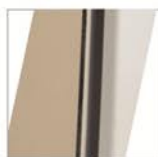
Double Layer 1.2mm sheet metal surface, melamine board inward.